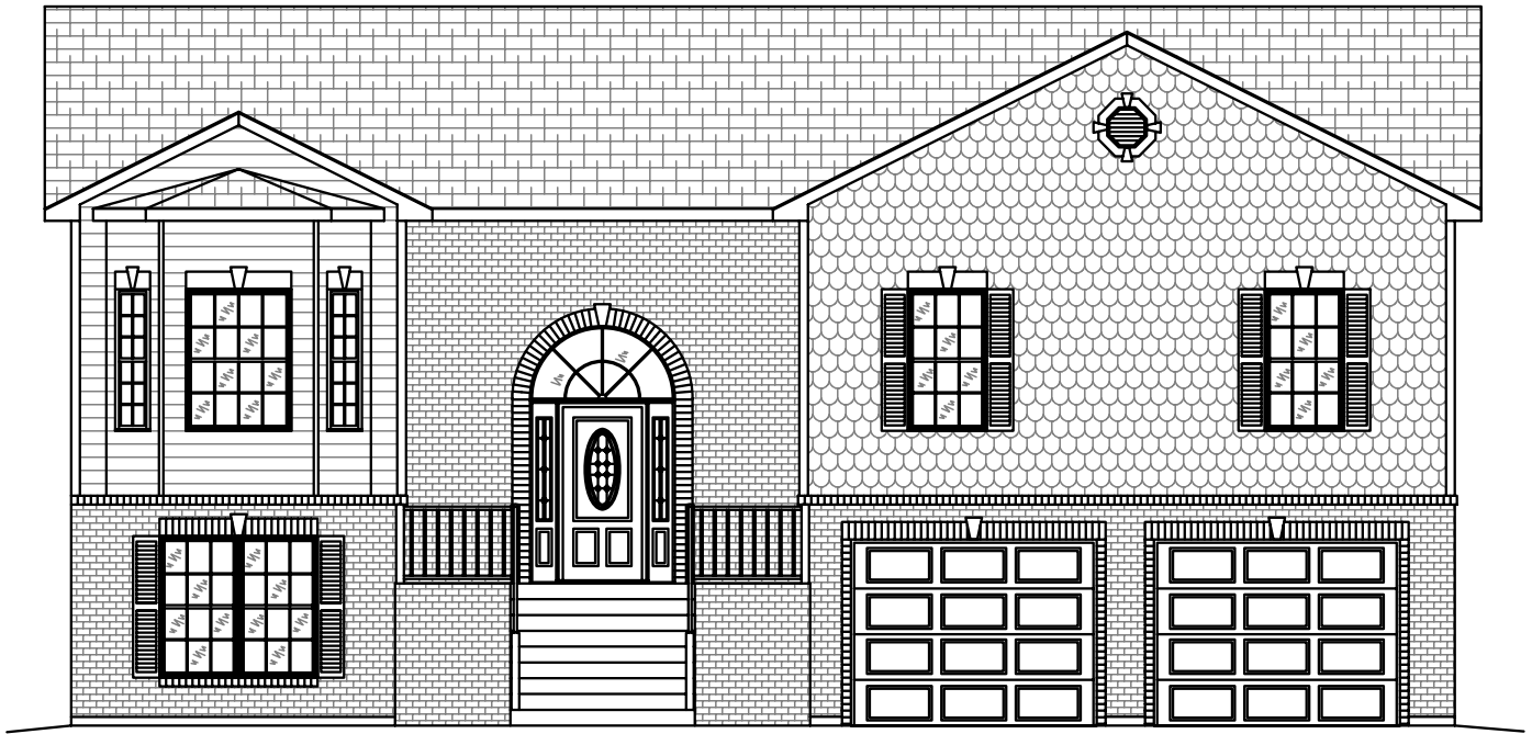
PLAN 2400 ELEV. A - W/SLAB FOUNDATION